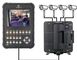
Live view using Reviewer or video out to monitor