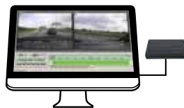
Review recordings directly from a removable cartridge