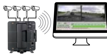
Multi-channel live view and wireless download of recordings