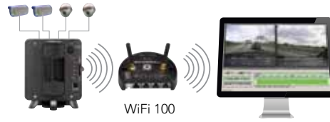
Multi-channel live view and wireless download of recordings