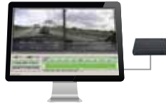
Review recordings directly from a removable cartridge