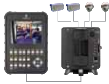
Live view using Reviewer or video out to monitor